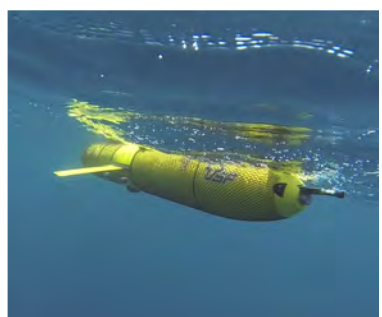
Figure 1 : Slocum glider with 200 kHz AZFP echosounder under test